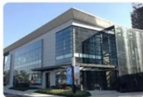
R & D center