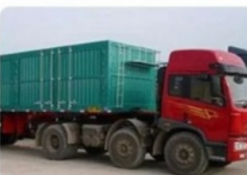
Loading container area