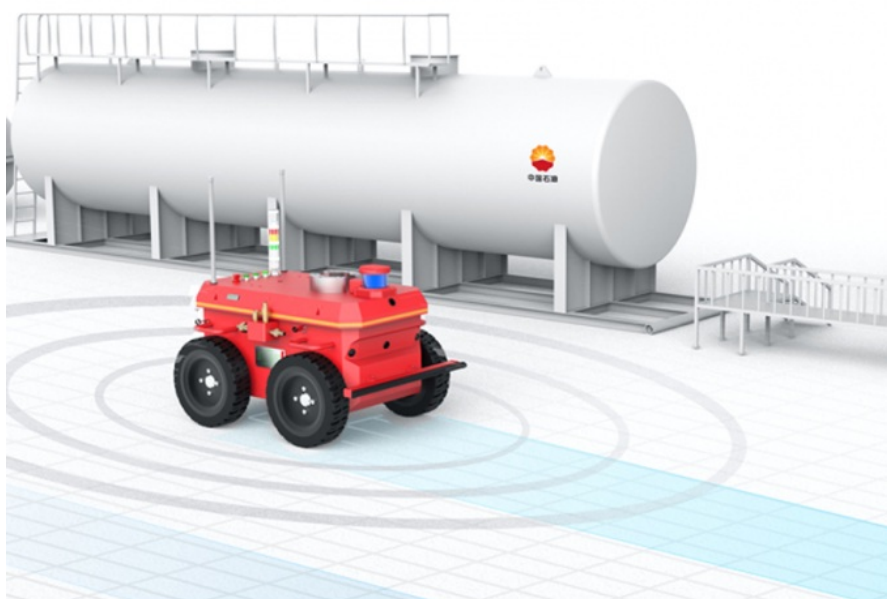
模块套装搭载展示 Module Set Display